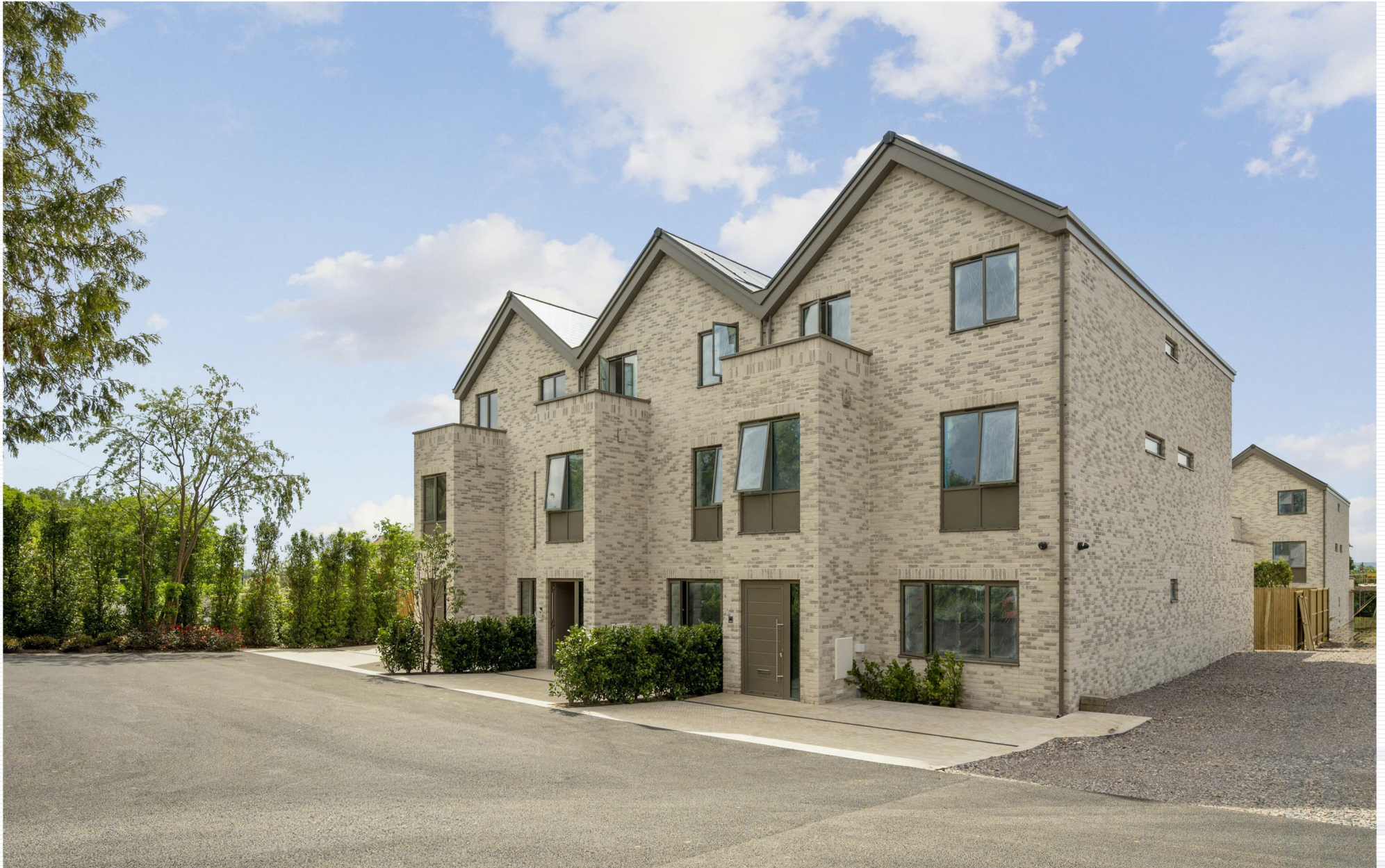
Coombe Lane West, Kingston Upon Thames, KT2 7DE